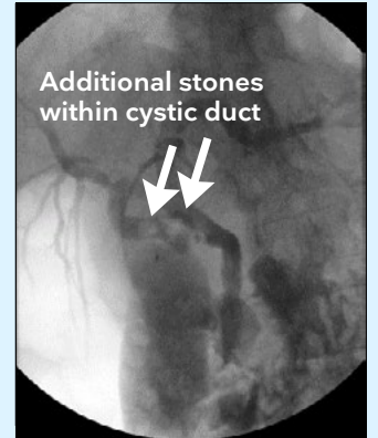
Figure 3: Fluoroscopy showing additional stones within the abnormally draining cystic duct.

The balloon catheter was advanced through the cystic duct into the gallbladder aided by guide wire, but attempts at stone removal failed. The stones were then pushed into the gallbladder by flushing the cystic duct with saline.